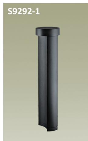
One Side Version

Custom made size and wattage available on request