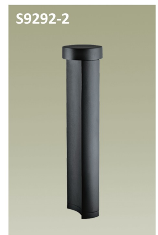
Two Side Version