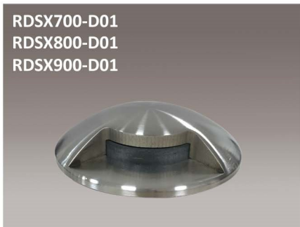
RDSX700-D01 RDSX800-D01 RDSX900-D01